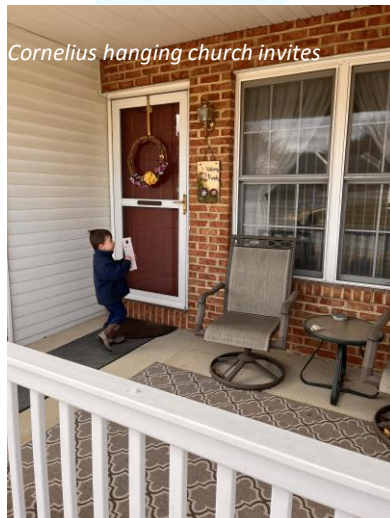
Cornelius hanging church invites